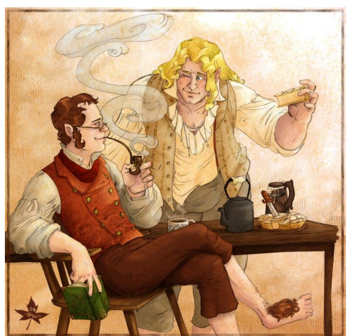
The Player's Guide to Duria

It is notable that Duria has one of two places in the known world where hobbits congregate in any numbers and involve themselves in national government. Danas, on the