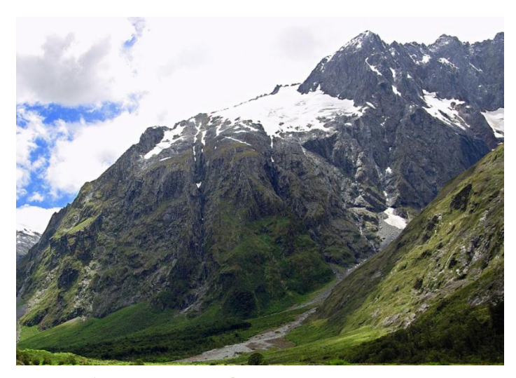
A PASS INTO THE CAMBRECIAN MOUNTAINS

The weather tends to be mild, relative to the other two known continents, with large, violent storms rare. The southeastern coastline tends to be hit by hurricanes periodically, though not nearly as often as the Interior Shore of Aurea. For much of the continent, spring and summer tend to bring ample rainfall, with autumn and winter being comparatively drier. Weather patterns tend to move from west to east along westerlies, though northeast trade winds tend to bring warm rain to the Pirate Isles during the summer months. The northern half of the Divian Peninsula tends to have stormier winters than in southern climes, with blizzards lasting several days not uncommon. The Divian Mountains tend to protect the southern Divian Peninsula from the frigid northern winds. The plains of Lun Dorak have no natural protection from extreme weather and tornados are not uncommon during the spring storm season.