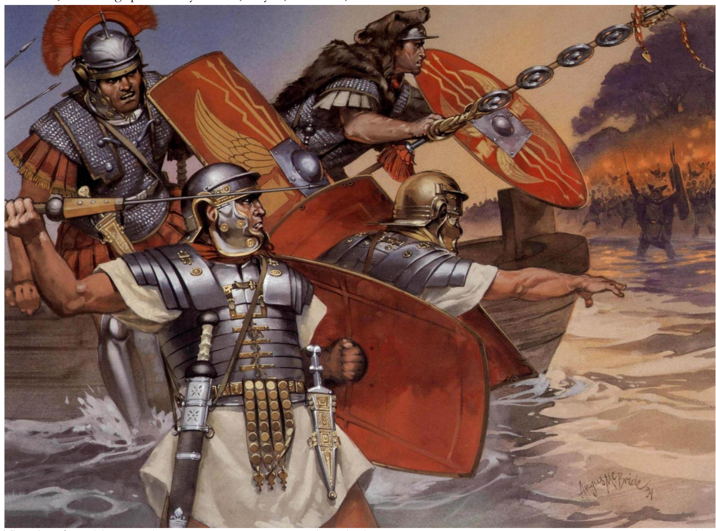
The Player's Guide to Duria

About three centuries after the arrival of Zeth on Duria, a young boy named Garimund of Ryard discovered a flying ship, the Glorious Galleon, flying in the skies above the flock of sheep he was (poorly) tending in a rural pasturage now located in Koramia. After chasing after the drifting ship for several days, he finally found a hilltop high enough to allow him to board the vessel. He found the ship itself empty, though in a small room at the aft of the ship he discovered the rotting corpse of a man in strange, alien armor gripping an ancient tome. The tome, when it was finally translated by Imperial scholars, contained the stories and lessons of Vortumnus, god of chivalry. Most importantly, however, was the retelling of the Tale of the Last God, wherein Fides, god of oaths, and Meliboea, goddess of justice, were fleeing the wrath of Lord Ptharos for violating his prohibition As in the Aebasan and Imperial against procreation. traditions, the story faithfully told how Lord Ptharos found the two lovers just as Meliboea was giving birth to Vortumnus and, recognizing the nobility in the newest god,