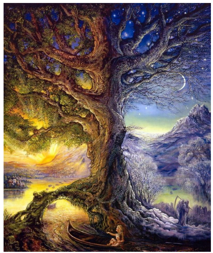
Page | 19

Though worship of Baelthor is limited mainly to masons some scholars and smiths in human states, worship of Baelthor as Balthor is pervasive throughout the dwarven kingdoms of Derlos and Gundag. Though propitiating of the other descendants of Ptharos is allowed when circumstance requires it and relationships with their human clergies friendly, only gods who are descendant from Balthor